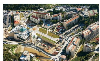
LAU - Byblos