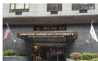
LAU – New York