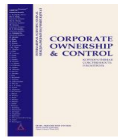
Journal of Corporate Ownership and Control