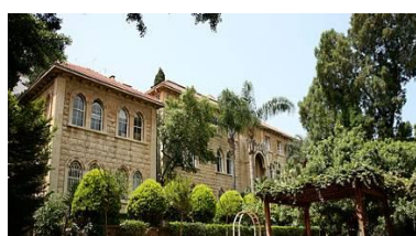
LAU - Beirut