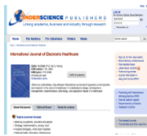
International Journal of Electronic Healthcare