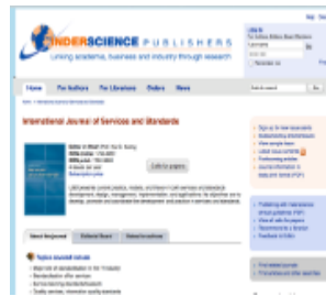
International Journal of Services and Standards